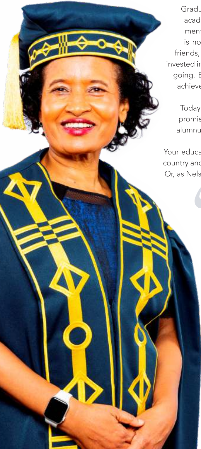
Dr Geraldine Fraser-Moleketi Chancellor

Graduation is a significant milestone in life. It is the culmination of an academic journey that reflects your ambition, determination, commitment, perseverance, and demanding work. We know that this journey is not yours alone, as many have travelled with you. These are your friends, your lecturers, supervisors, mentors, and your family. They have invested in you financially, guided your studies and encouraged you to keep going. But above all, they have believed in your ability to succeed and achieve this graduation dream.