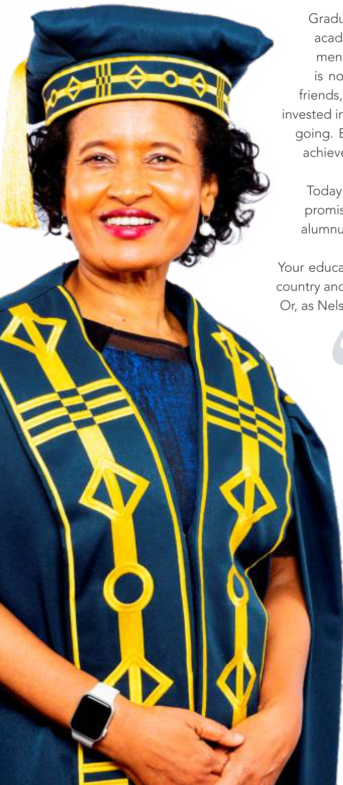
Dr Geraldine Fraser-Moleketi Chancellor

Graduation is a significant milestone in life. It is the culmination of an academic journey that reflects your ambition, determination, commitment, perseverance, and demanding work. We know that this journey is not yours alone, as many have travelled with you. These are your friends, your lecturers, supervisors, mentors, and your family. They have invested in you financially, guided your studies and encouraged you to keep going. But above all, they have believed in your ability to succeed and achieve this graduation dream.