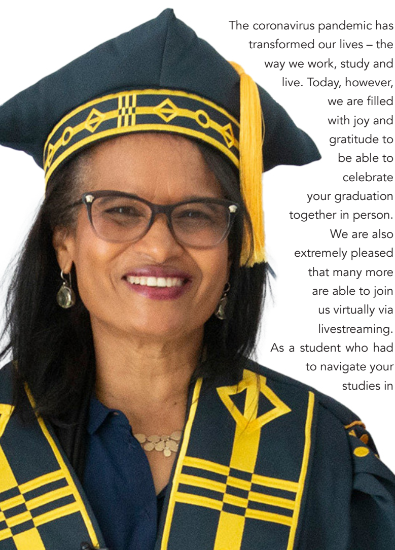
Dr Geraldine Fraser-Moleketi Chancellor

Njengomfundi oye waqhuba izifundo zakhe ngeendlela ebezingalindelekanga, sikothulela umnqwazi